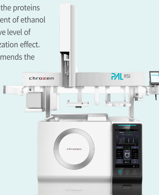
Fig 1. ChroZen GC

There might be different regulations depending on the region.